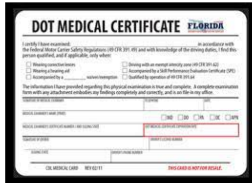
Medical Card - Front