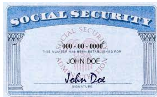
Social Security Card - Front